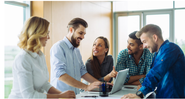
Cost of Multiple IT Systems vs. Office 365